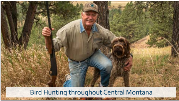
Bird Hunting throughout Central Montana