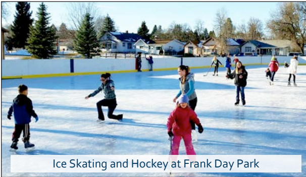
Ice Skating and Hockey at Frank Day Park

Funding provided by Lewistown Hoteliers Tourism Business Improvement District (TBID)