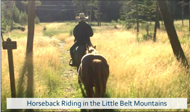
Horseback Riding in the Little Belt Mountains