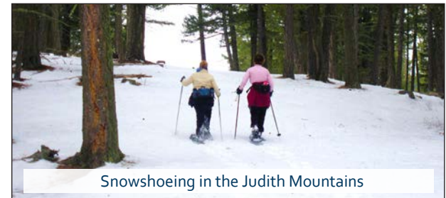
Snowshoeing in the Judith Mountains