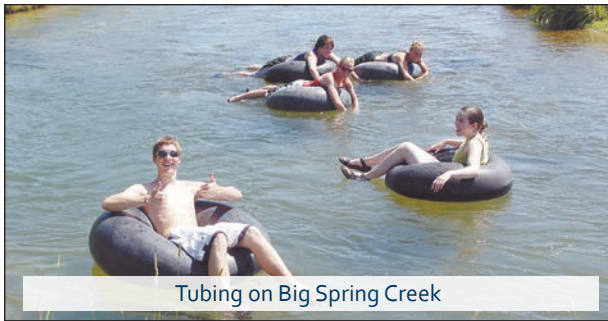
Tubing on Big Spring Creek