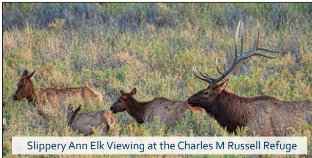
Slippery Ann Elk Viewing at the Charles M Russell Refuge